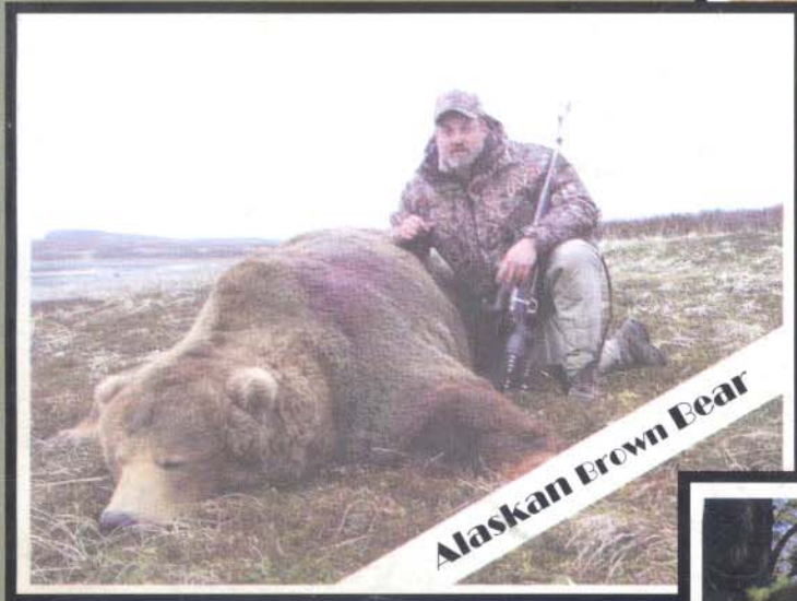
Alaskan Brown Bear