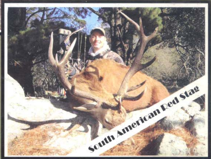
South American Red Stag