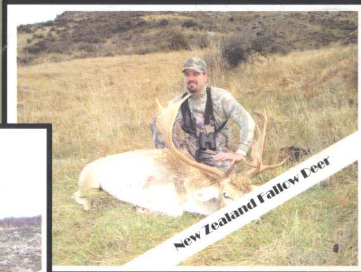
New Zealand Fallow Deer